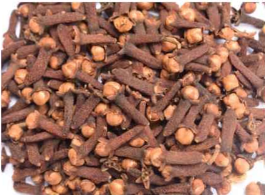
Harvested Buds (i): Before Drying, (ii): After Drying

with the favourable agro climatic conditions of the high ranges of Kerala. Clove is propagated through seeds collected during May to June from healthy, regularly bearing trees. Seeds are raised in shaded nursery beds rich in organic matter, and seedlings are typically transplanted after about one year, as practiced in the Thalnad region.