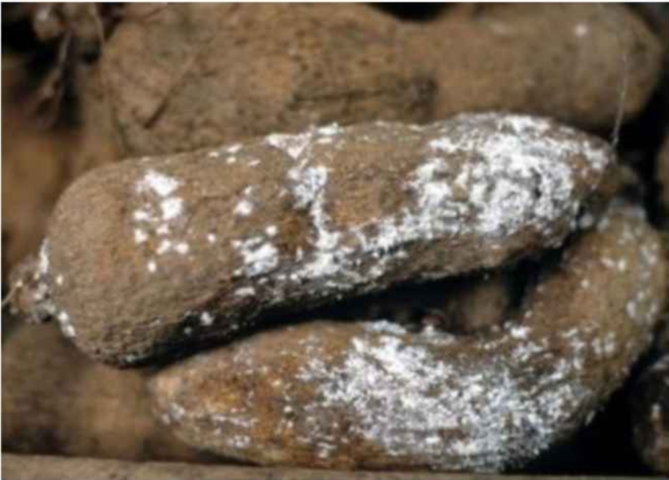
Dioscorea alata tuber under attack by mealybugs, the biological vector for Dioscorea Bacilliform Virus (DBV).

infection does more than just reduce weight; it compromises the sprouting capacity and nutritional quality of the tubers, effectively stealing the future of the crop from the very hands of the farmers who sustain it. Indian agricultural data highlights that in states like Kerala, Dioscorea alata often carry viral loads due to the recycling of approximately 25% of each harvest as seed for the next season. Yams have a multiplication ratio as low as 1:4 or 1:6. Viral pathogens act as an invisible tax on global food security, siphoning off a significant portion of potential harvests before they ever reach a plate.