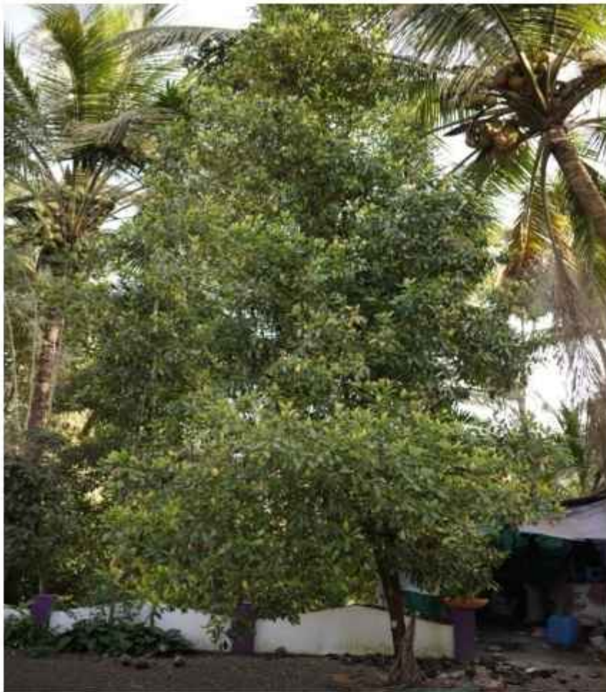
Clove Tree in Thalnad

its strong pungent aroma due to essential oils, especially eugenol, which makes it important in food, medicine, and industrial applications. In India, clove cultivation is well established, particularly in Kerala where it is known as “Grambu” or “Karayampoo,” with a major cultivation belt in the Erattupetta Block Panchayat of Kottayam district. The locally adapted type, Thalnad Grambu, is renowned for its superior flavour, pungency, colour, and medicinal value, contributing to its premium market status and GI recognition.