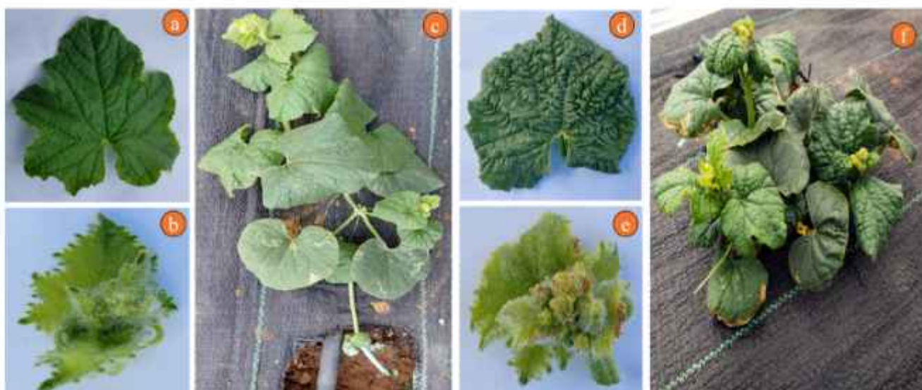
Figure 1. View of muskmelon of health plant and plant with chilling injury. a) Normal health leaf, b) health shoot divide of meristem tissues, c) healthy plant, d) Leaf cupping due to chilling injury, e) breakdown of meristematic tissue of plant shoot tip due to chilling injury, f). stunted and deformed plant after chilling injury.

alleviated promptly, prolonged exposure results in irreversible degeneration. Dictyosomes (Golgi bodies) also swell initially, but extended chilling ultimately leads to their disintegration, signalling a collapse of the cellular secretory and transport machinery.