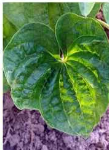
Symptoms of viral infection in different yam leaves.