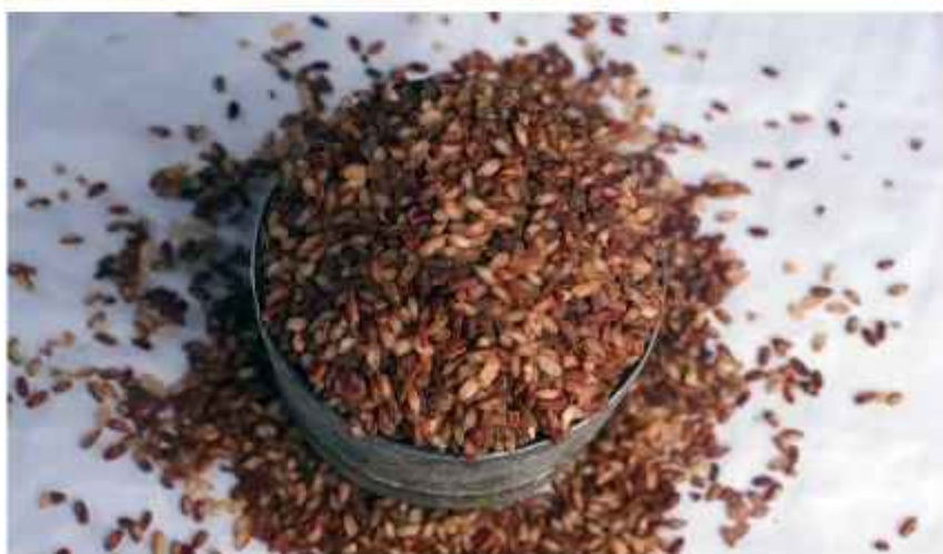
PALAKKADAN MATTA RICE

Horticultural crops add another layer of diversity. Vazhakkulam pineapple, Kuttiattoor mango and Chengalikodan Nendran banana are distinguished by