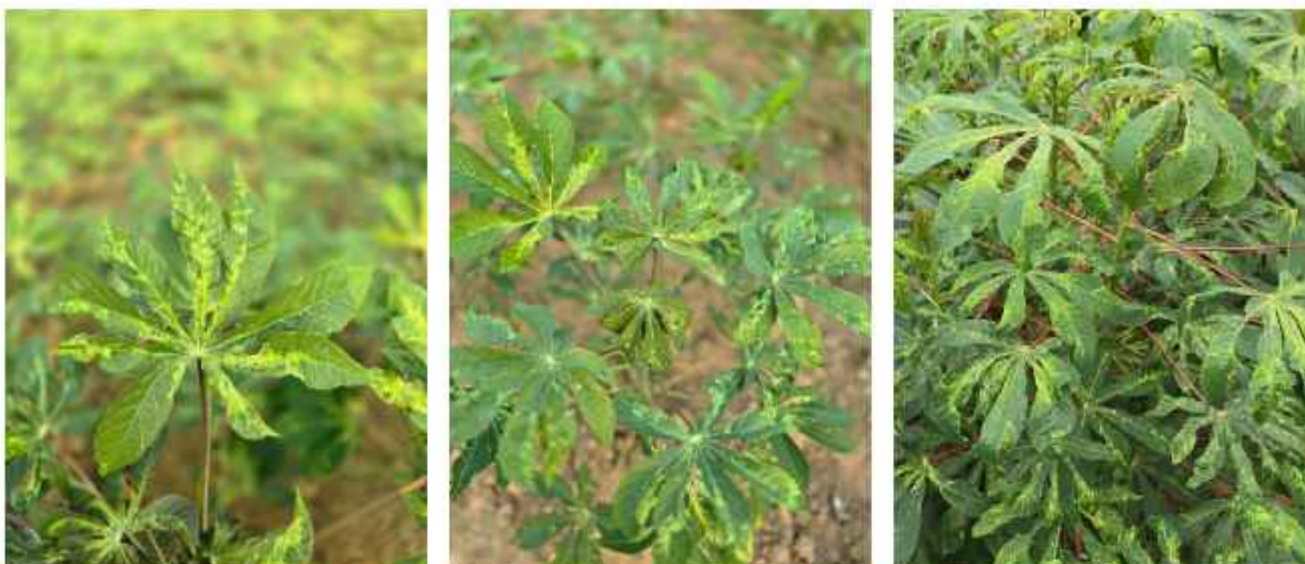
Fig 1. Effect of Cassava Mosaic Virus Infection on Leaf Morphology of Cassava

on coordinated enzymatic activity and sufficient nutrient availability. Viral infection disrupts this balance by diverting precursors and interfering with gene regulation. Simultaneously, increased production of reactive oxygen species (ROS) accelerates chlorophyll degradation. The consequence is a functional decline in photosynthesis. Leaves may remain partially green, yet their light-harvesting efficiency drops significantly. This reduction in photosynthetic output translates into lower carbohydrate production, directly impacting growth and storage root development. In effect, CMD leaves operate as if the plant were experiencing chronic shade stress, even under optimal sunlight (Liu et al., 2014).